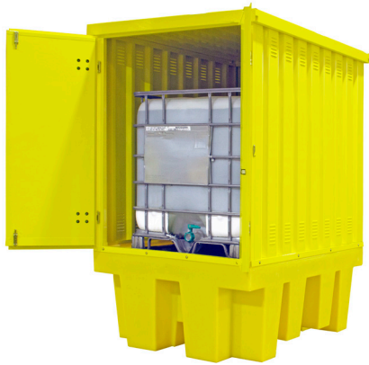
BB1HCS - Hard Covered