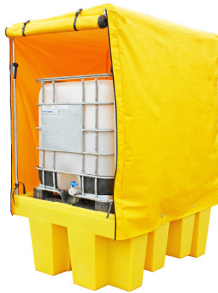
BB1C - Soft Covered